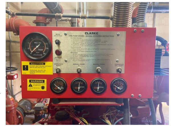
Front of Clarke Fire Control