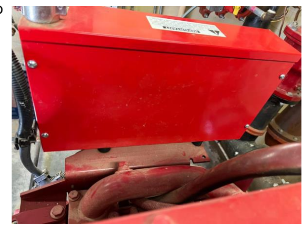
Back of Clarke Fire Control