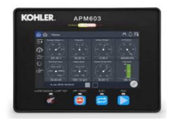
Kohler APM603 Controller