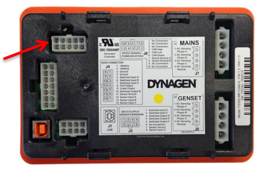
Modbus (RS485) Connection

The control will not support both the OmniMetrix and the Annunciator without the addition of the Serial Port Sharing device.