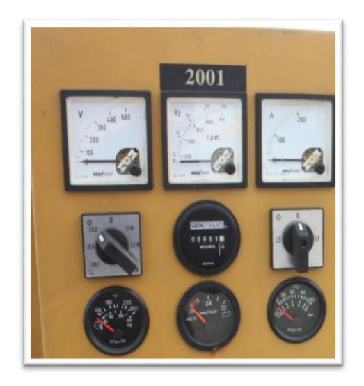
Olympian 2001 Controller