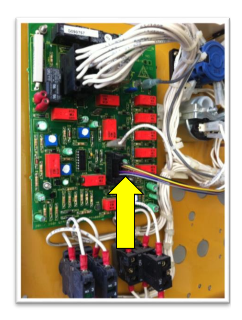
Controller Board with 10-pin Cable