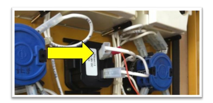
Hour Meter Connection for Orange Wire