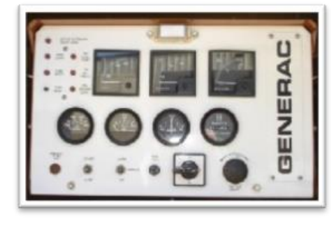
Generac C Panel Control