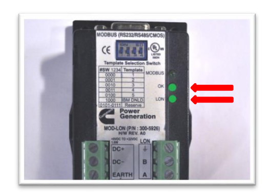
ModLon Gateway Normal Operation