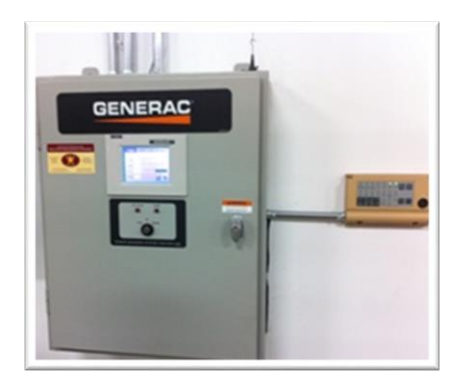
MPS System Controller