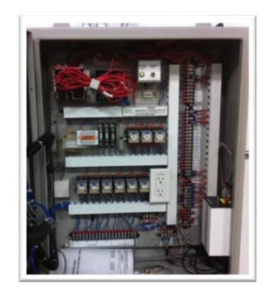
MPS Controller - Open