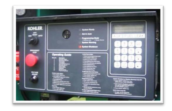
Kohler DEC340 Controller