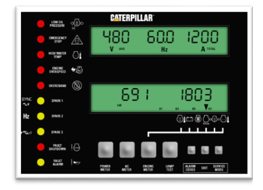
CAT EMCP 2 Control shown. CAT EMCP 1 Control is similar but has only one display.