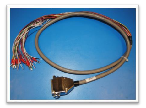
25-Pin Data/Power Cable

<u>www.omnimetrix.net</u>. Contact OmniMetrix for login instructions and web training.