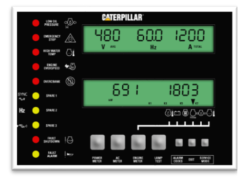
CAT EMCP II Controller