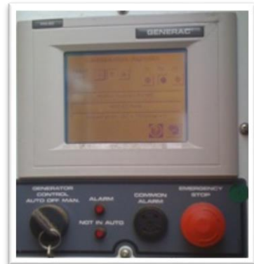
Generac G Panel Control