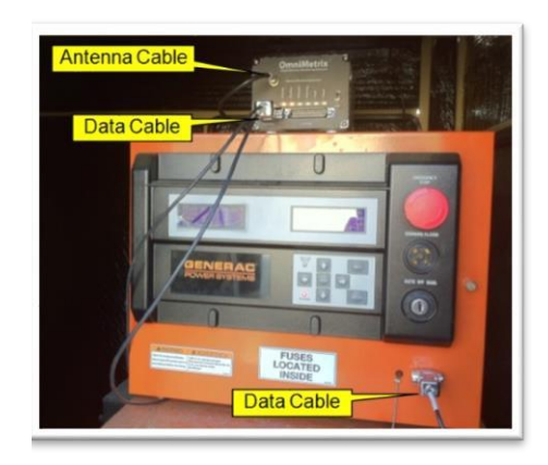
Data Cable and Antenna Cable Connections.