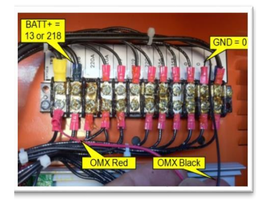
Power Cable Connections