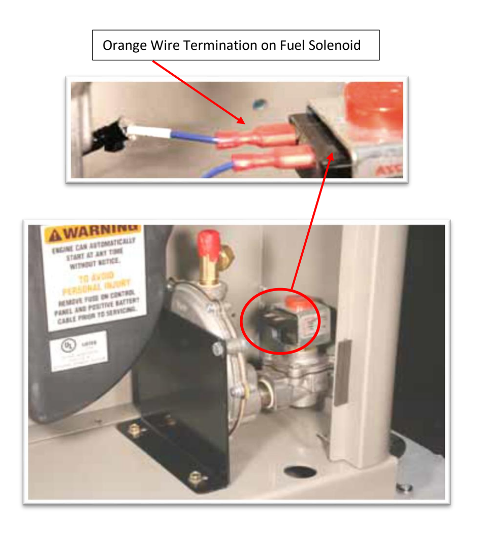
Briggs & Stratton Wiring Instructions