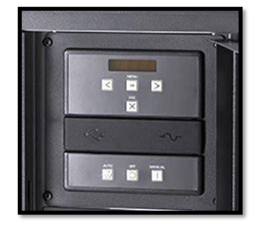
Alternate Briggs & Stratton Residential Control Panel