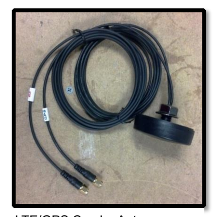
LTE/GPS Combo Antenna