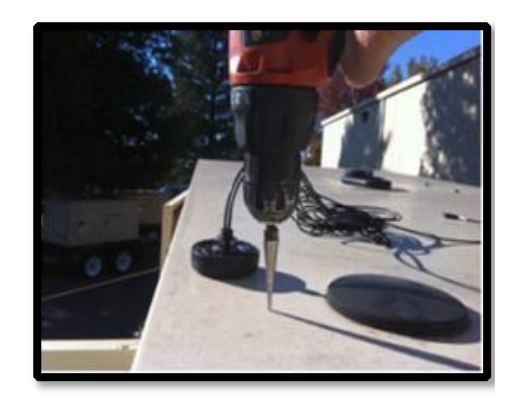
Drill 1/2" hole for antenna & cable