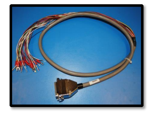
Power/Data Interface Cable

Mobile monitor front display with two antenna connections: RF (4G/LTE) and GPS