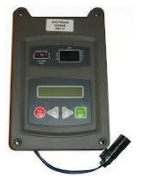
Generac Generation III Control